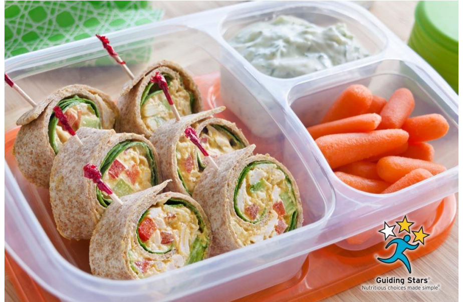
Mediterranean Chicken Salad Pinwheels | 2 Guiding Stars

With planning and balance, snacks can support nutrition and health